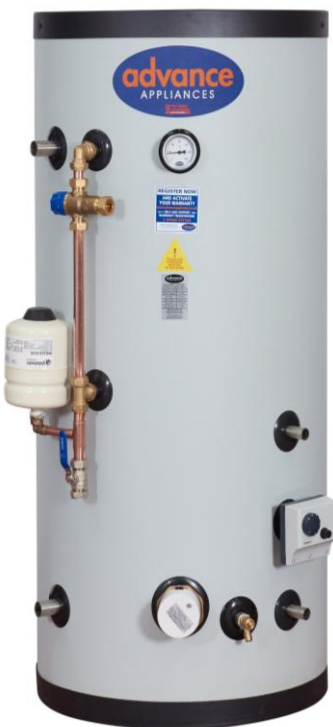
Thermal Store Cylinder only

A range of cylinders without the cold section, allowing for more choice in positioning the store in your home. The cold feed is remotely fitted by the customer at the top of the system, so the cylinder store can be sited anywhere. The stores are designated TSDC for Direct Single Coil cylinders or TSiC for Indirect Twin Coil cylinders.