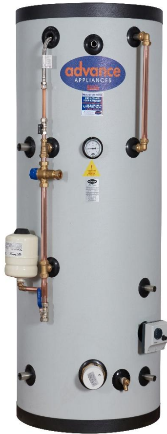
Thermal Store with integrated feed and expansion tank